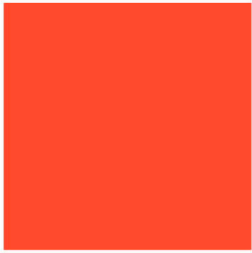
380RX BLAZE ORANGE Strong orange with red undertone

Easy-to-use, easy-to-mix color matching system with 18 intermixable colors.