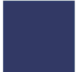
690RX INDIGO BLUE Strong blue with green undertone