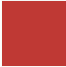
470RX RIO RED High performing, bright red with optimum durability to pass crock test