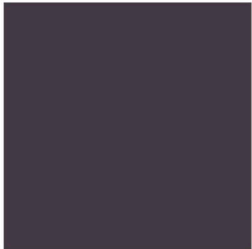
580RX DEEP VIOLET Very strong purple with blue undertone