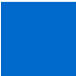
960RX ELECTRIC BLUE Bright, transparent blue with a green undertone