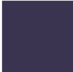
670RX MIDNIGHT BLUE Strong blue with red undertone