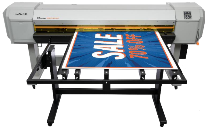
ValueJet 1638UH Mark II