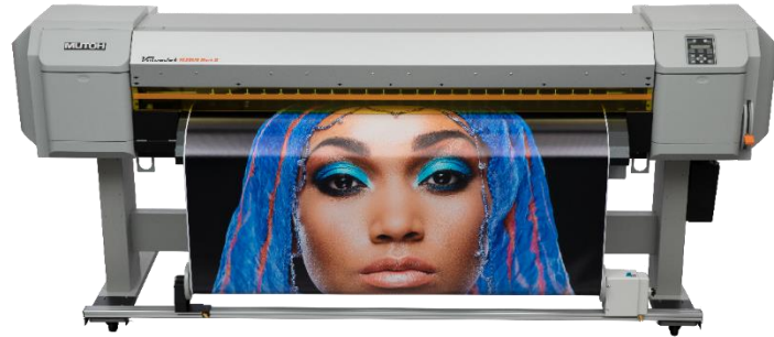
ValueJet 1638UR Mark II